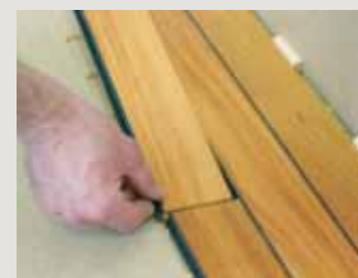
4 – Place the blade on the extremity of the previous one