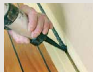
6 – Apply a peripheral joint " NAVYJOINT " and smooth it