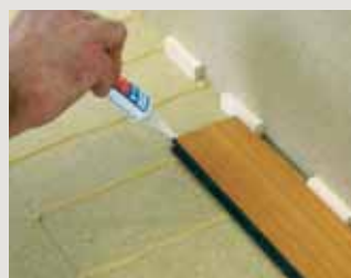
3 – Gluing in the end of blade