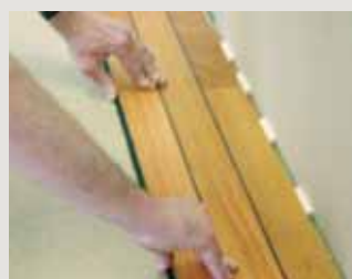
5 – Apply then the blade to its length