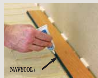
2 – Gluing of tongues with NAVYCOL+