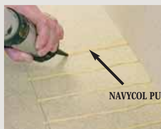
1 – Sticking cordon with NAVYCOL

MAINTENANCE: Navylam+ flooring can be cleaned easily. To renovate your bathroom wood flooring NAVYLAM+ , it is advised to use the spray or the can " NAVYHUILE " (available in all our retailers) and wipe with a clean moist cloth.